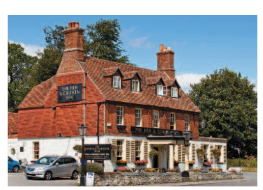
Hen & Chicken, Upper Froyle

Froyle Park is a new venue with self catering apartments and facilities available for hire.