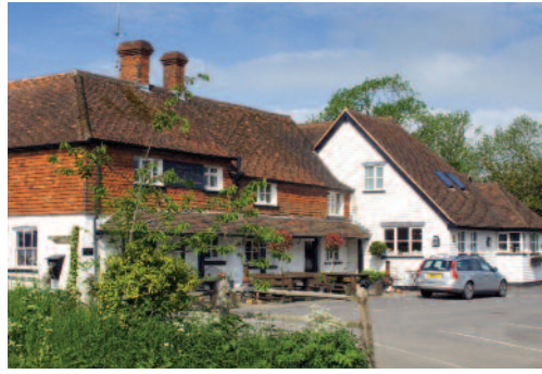
The Anchor Inn, Lower Froyle